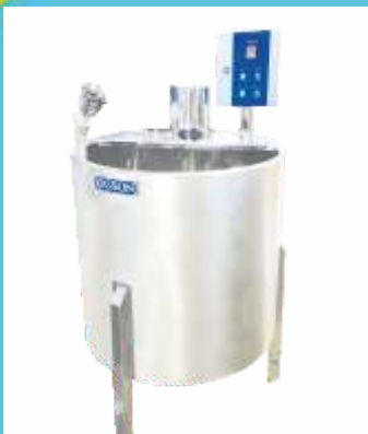
Fully Loaded Stock Tank