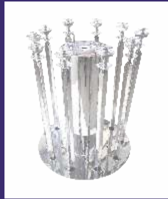
Carrier for Cones