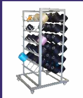
Trolley for Cones