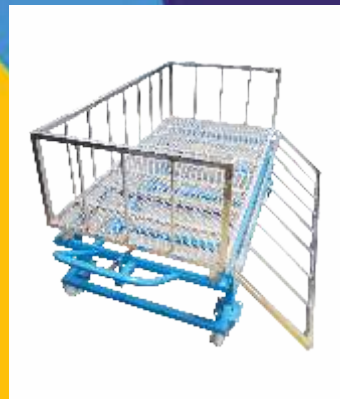
Loose Material Carrier