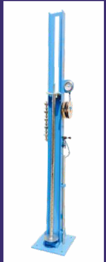
Package Pressing Machine