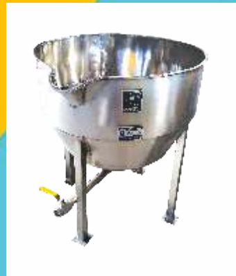
Chemical Mixing Pot