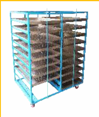
Trolley for Trays