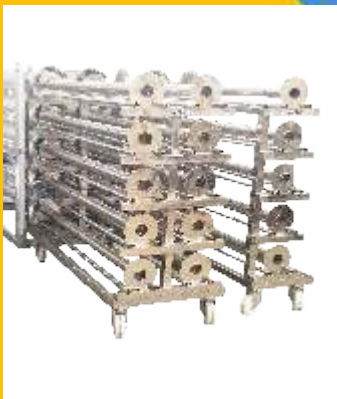
Trolley - Horizontal