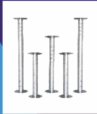
Bobbin for Tape