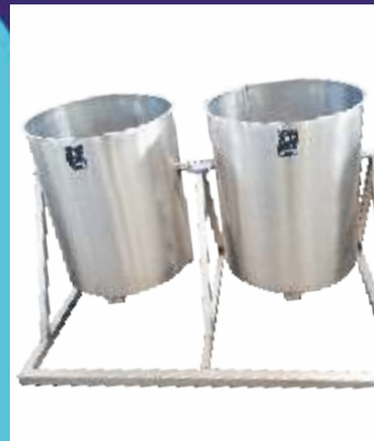
Chemical Storage Tank