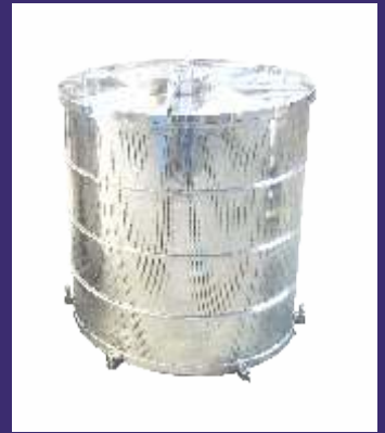
Fiber / Hanks Carrier